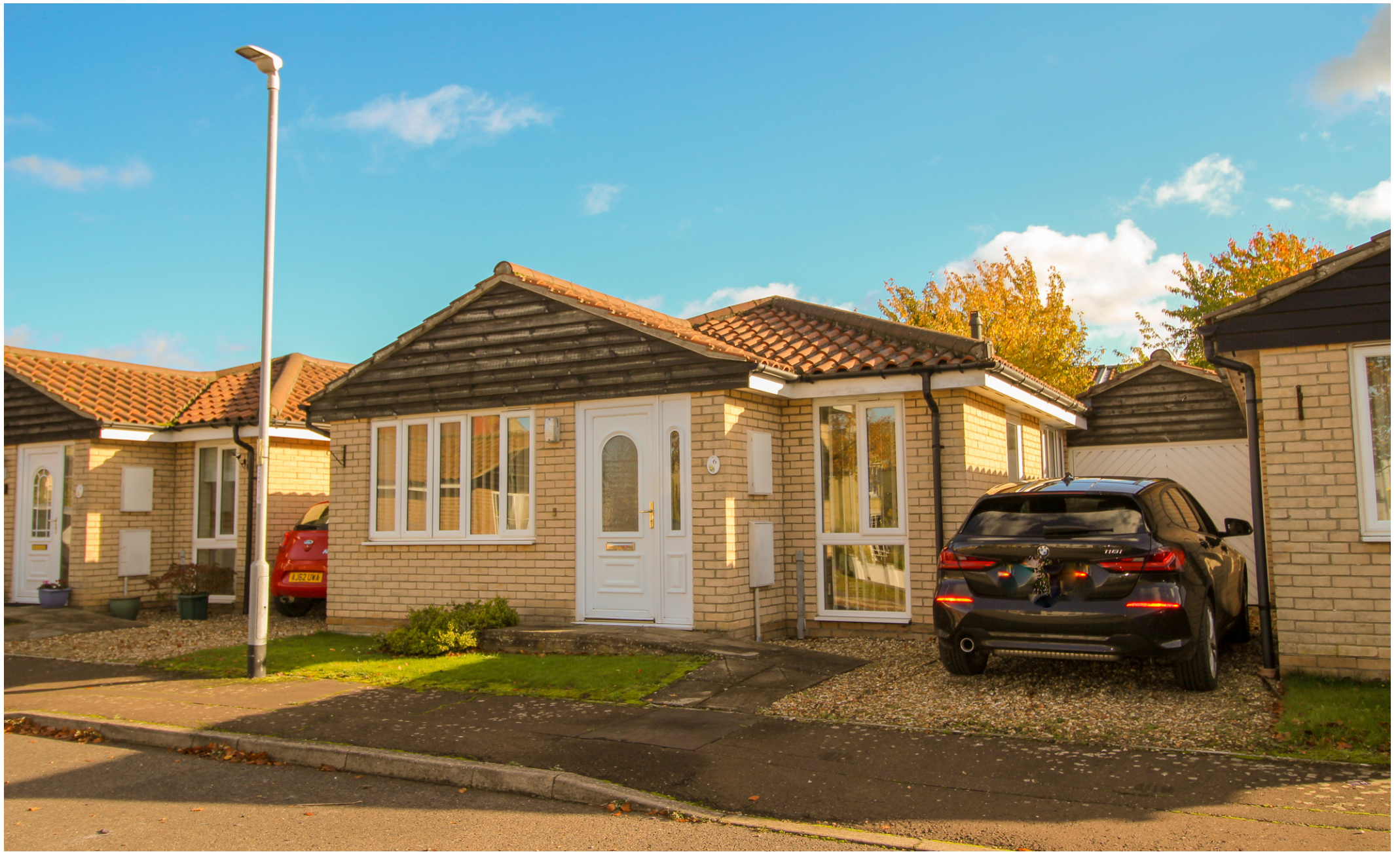
Bewicks Mead, Burwell, Cambridgeshire.