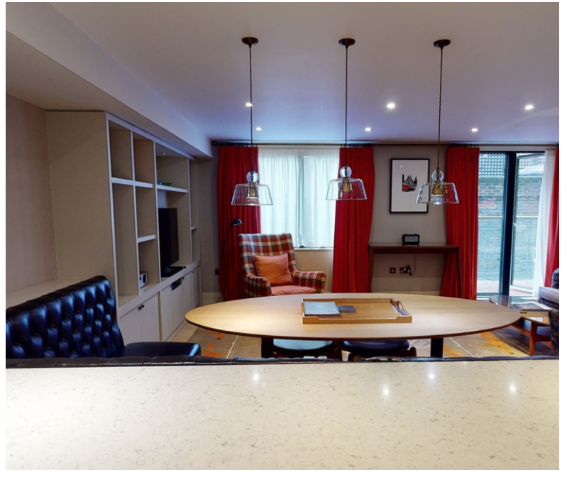
Fully Furnished Serviced Apartments near Harrods in Knightsbridge in London SW7.