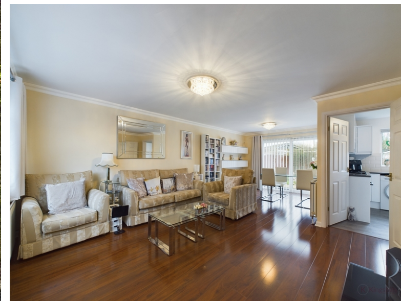
16 Grimms Meadow, Walters Ash, High Wycombe, Buckinghamshire, HP14 4UH