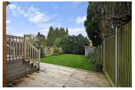
Great Baddow £625,000 4-bed detached house