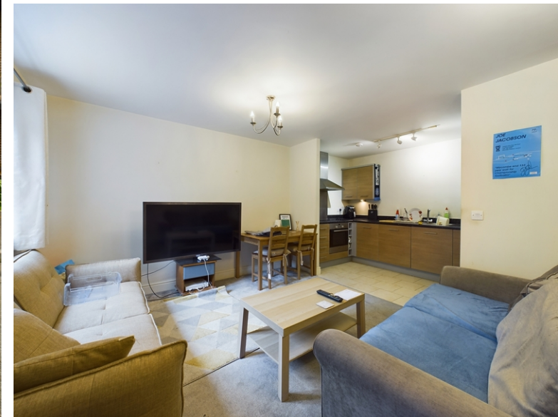
Flat 12 Aspen Court, Freer Crescent, High Wycombe, Buckinghamshire, HP13 7YG