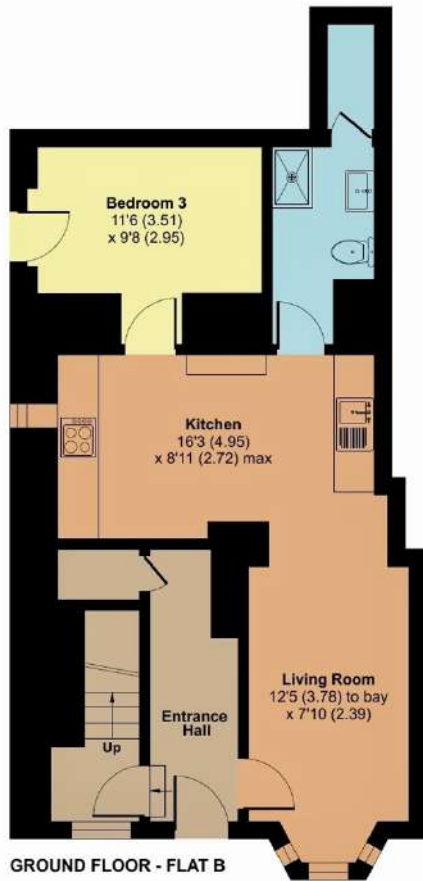
GROUND FLOOR - FLAT B