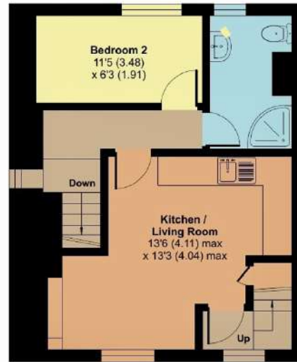
FIRST FLOOR- FLAT A