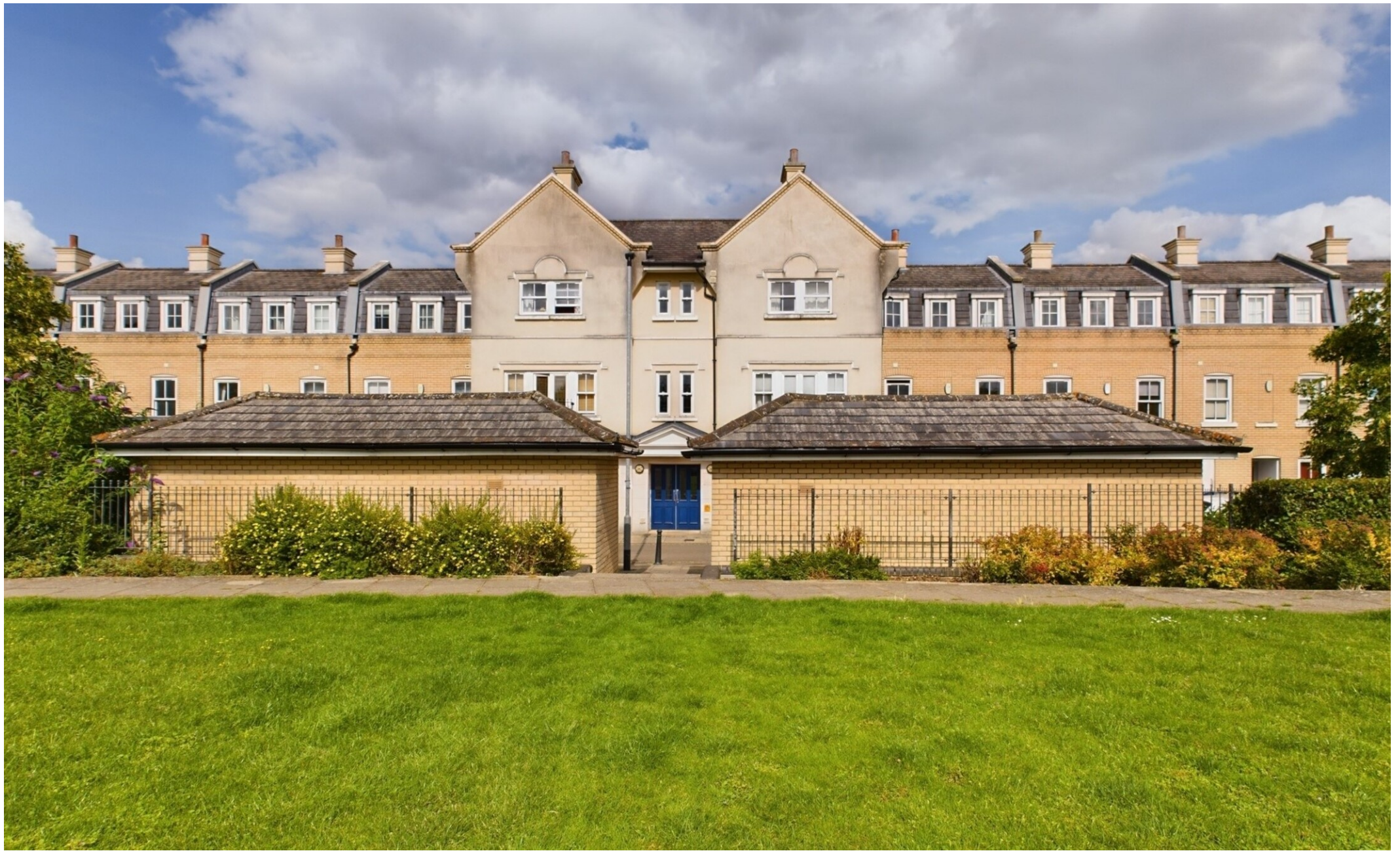
St Matthews Gardens, Cambridge CB1 2PS