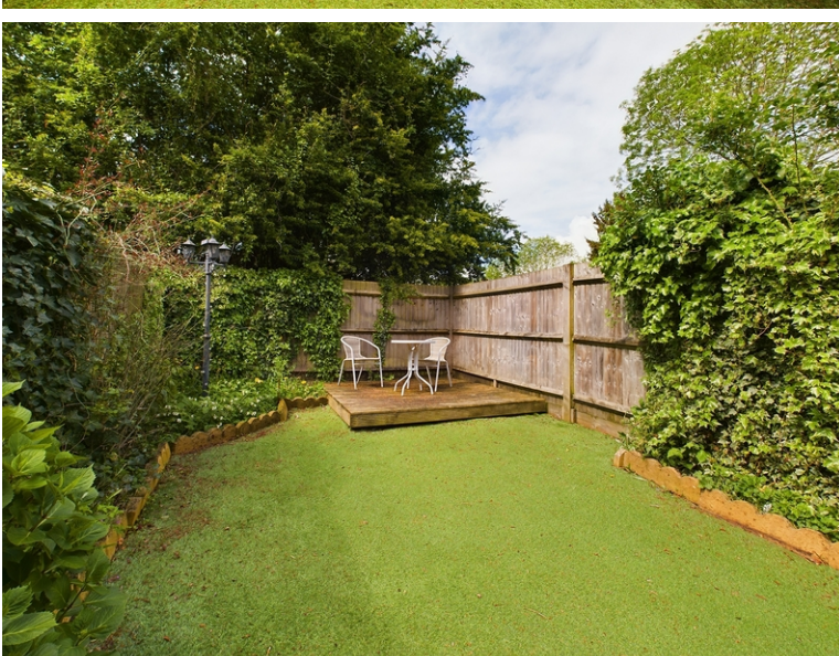
46 Milton Place, High Wycombe, Buckinghamshire, HP13 7DN