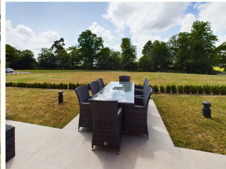
Flat 16, Uplands House, Four Ashes Road, High Wycombe, HP15 6DY