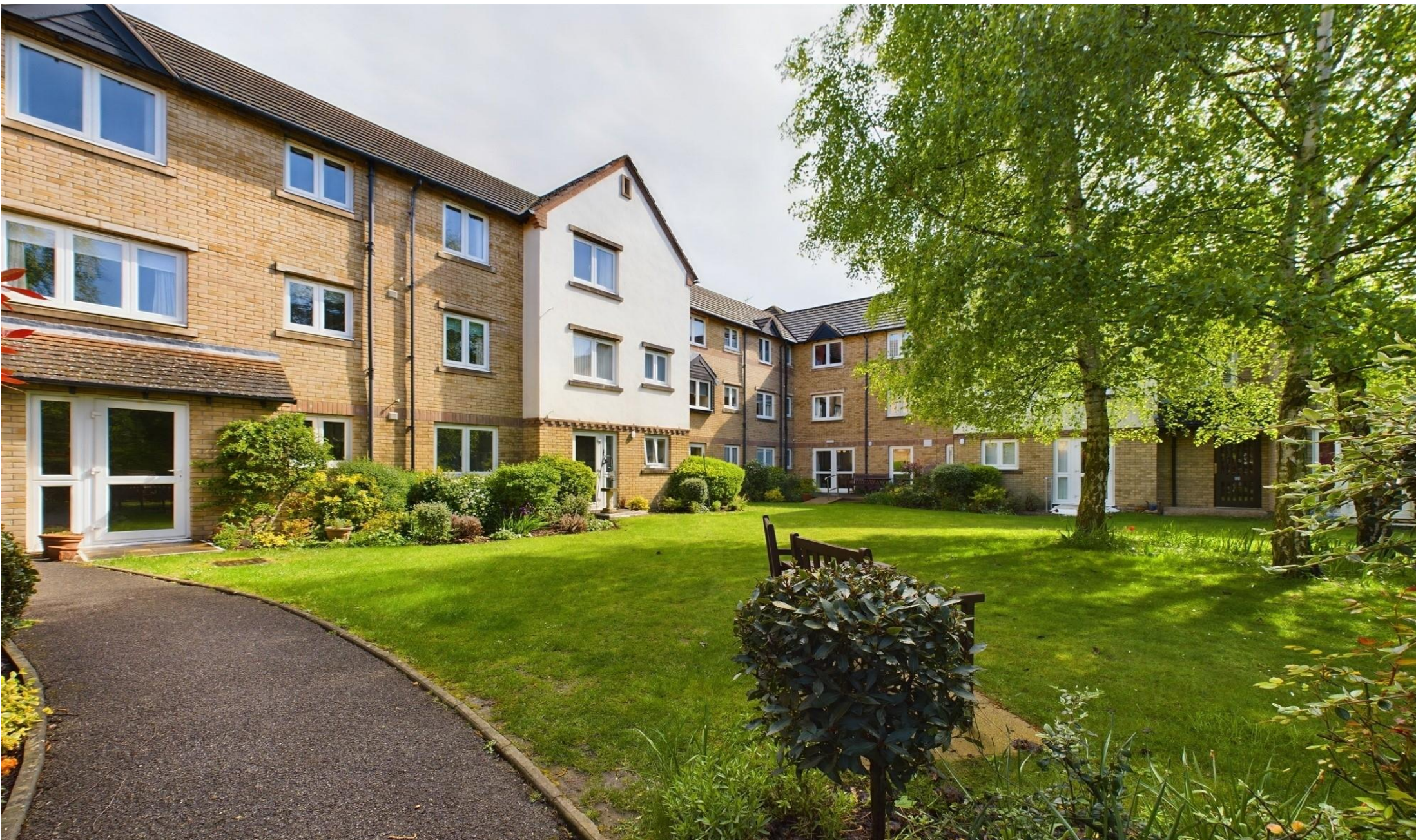
Haig Court, Cambridge CB4 1TT