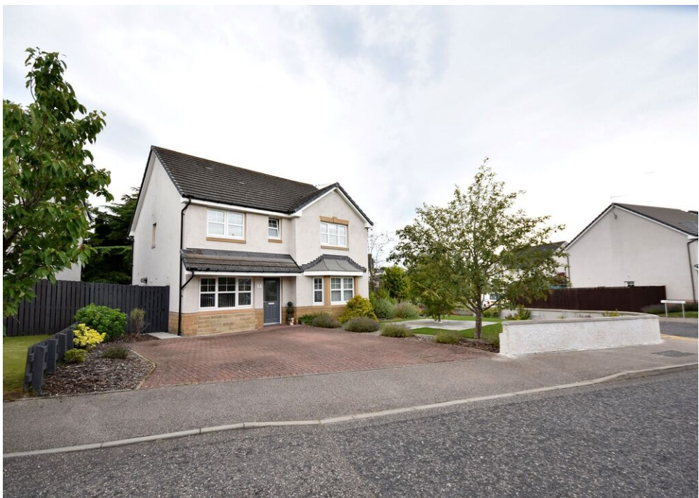
Offers Over £340,000

Benefiting from a Corner Plot position is this roomy 5 Bedroom Detached Family Home located within the West End area of Elgin.