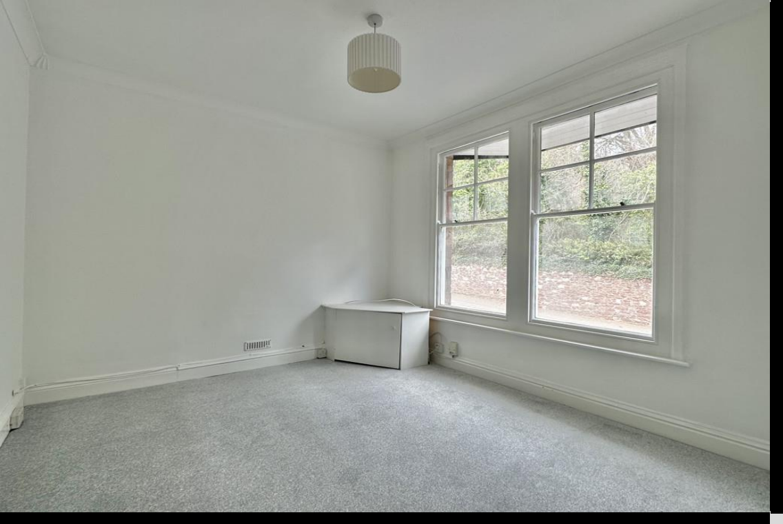
Our View "Great Investment or First time Buy"