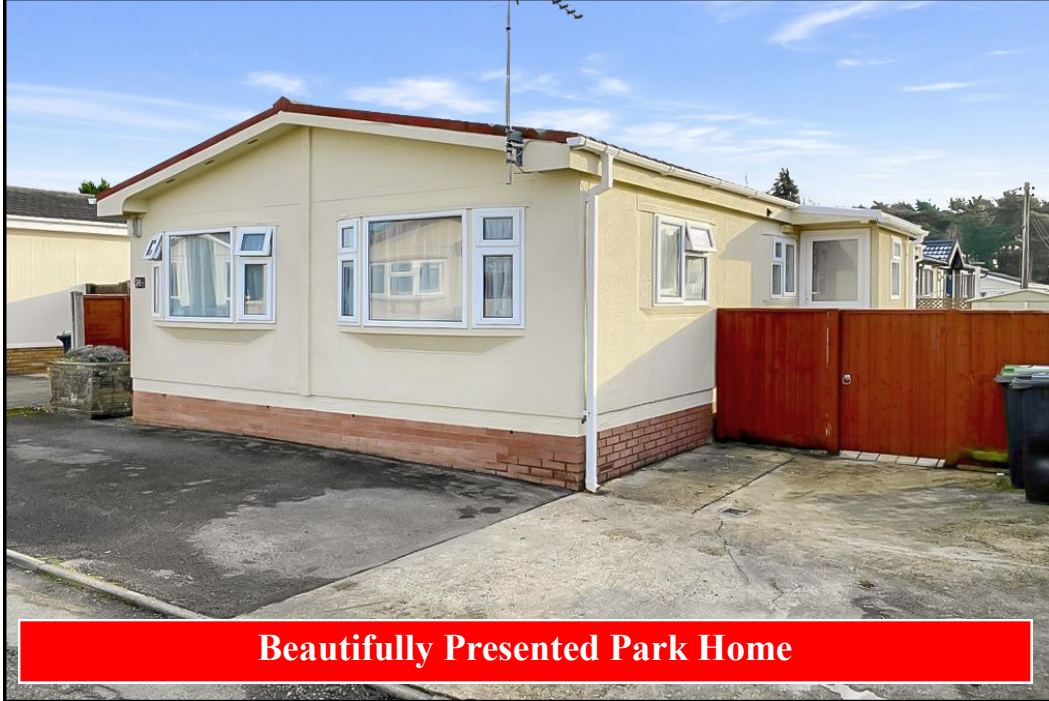
Beautifully Presented Park Home

98 Pinehurst Park, West Moors, Dorset. BH22 0BW