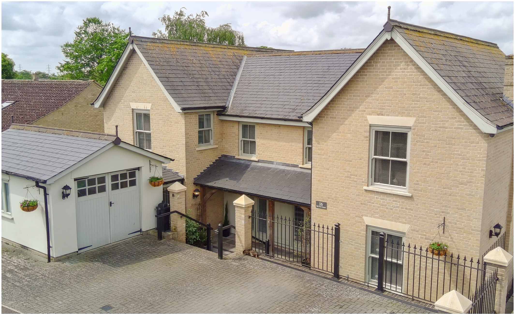
Mill View House, Burwell