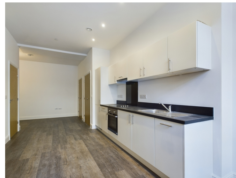
3 Birch House, The Old Works, Leigh Street, High Wycombe, HP11 2WP