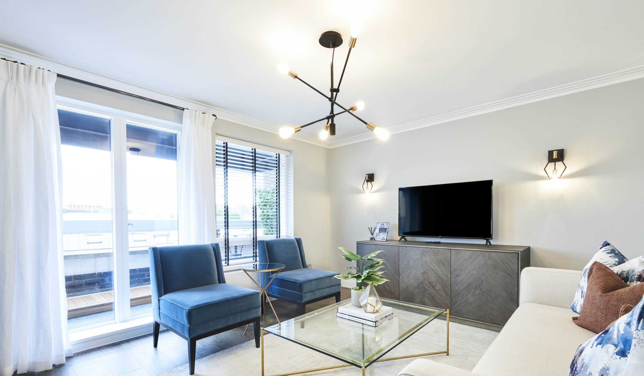
2 Bedroom 1 bath Flat, South Kensington, London SW3