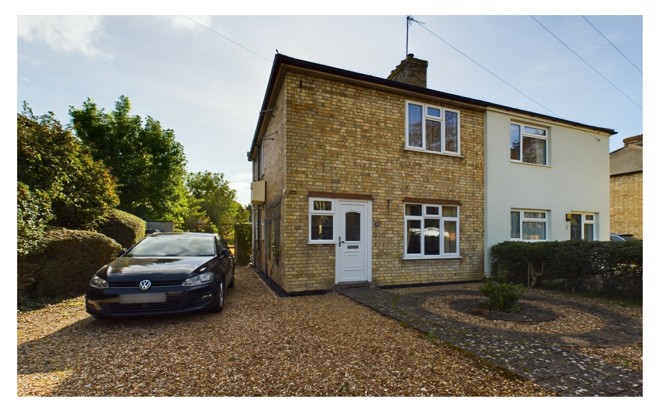
Wimpole Road, Barton, Cambridge CB23 7AB