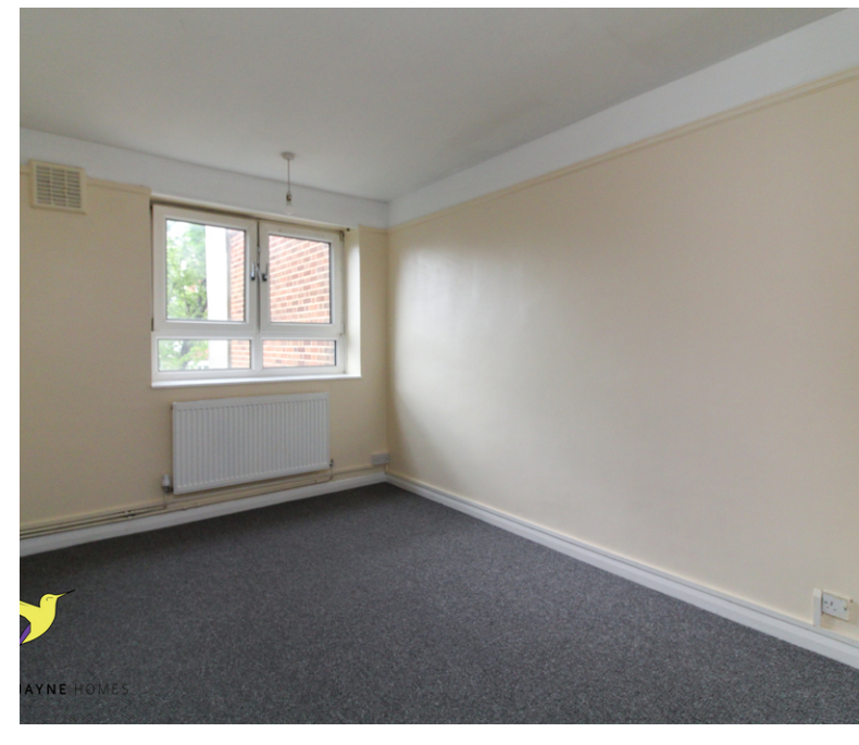
The Crest, Knights Hill, London

Mainly suiting a first time buyer or property investor, this well priced property is presented chain free by Harper Jayne Homes.