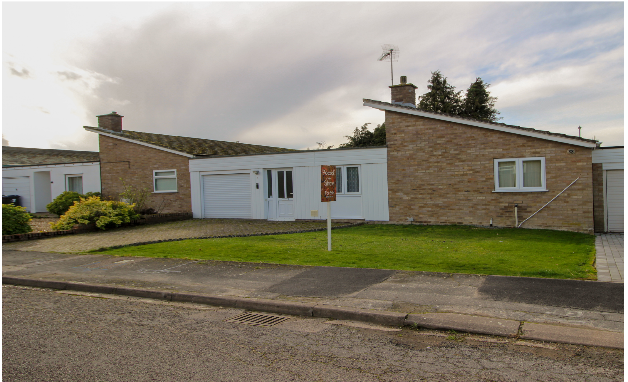
Parsonage Close, Burwell