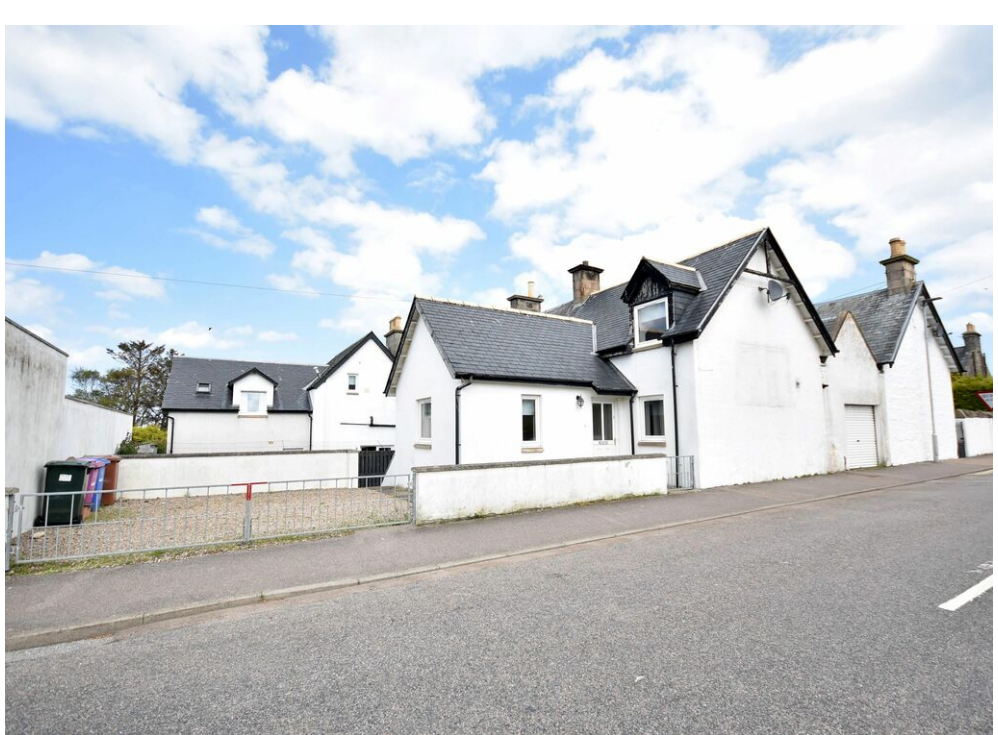
Offers Over £265,000

4 Bedroom Corner Terraced House with Integral Garage