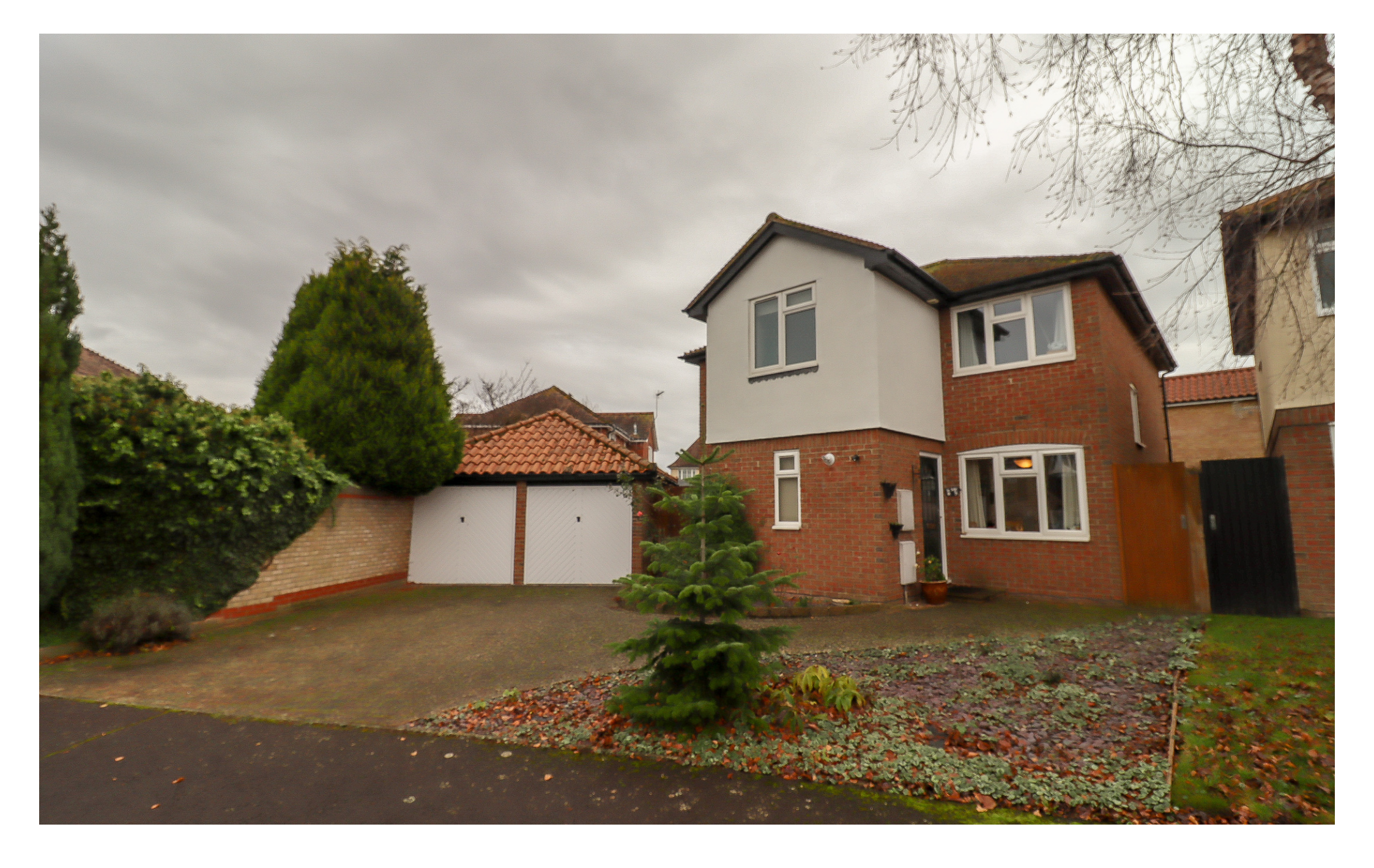
Melford Close, Burwell