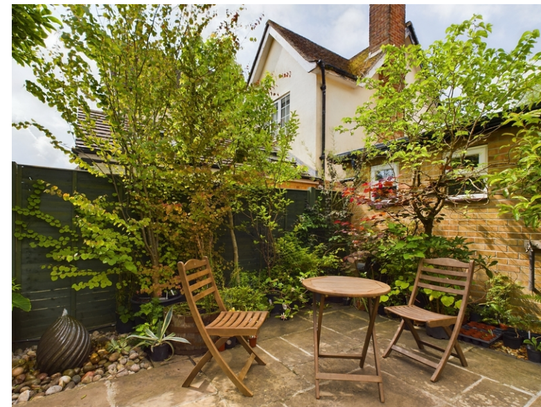
Fourwinds, 6 The Crest, Bledlow Ridge, Buckinghamshire, HP14 4AQ