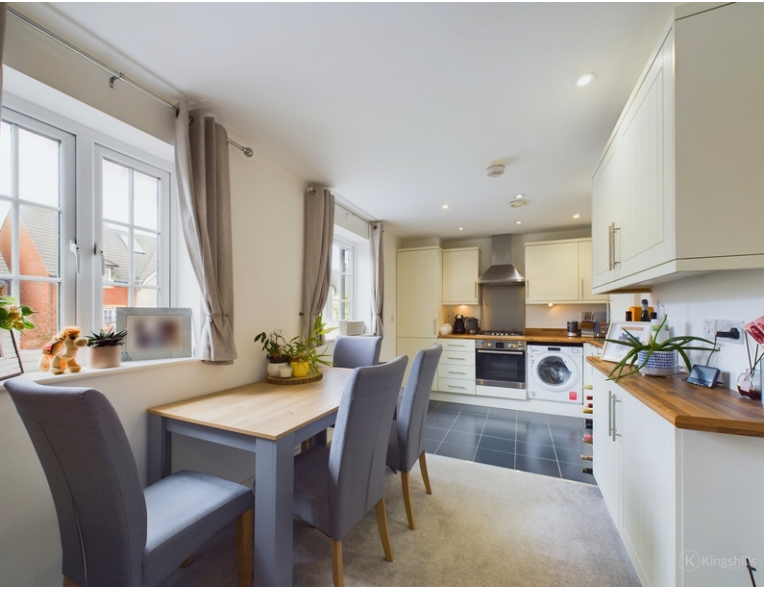
15 Grange House, Grange Drive, High Wycombe, Buckinghamshire, HP13 5GQ