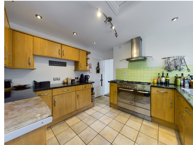
25 Clarendon Road, High Wycombe, HP13 7AR