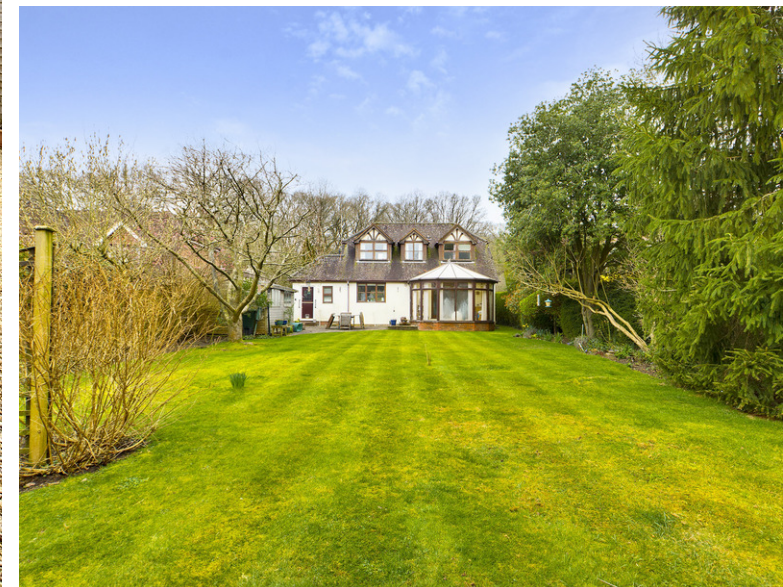
Mole Cottage, Naphill Common, Naphill, Buckinghamshire, HP14 4SZ