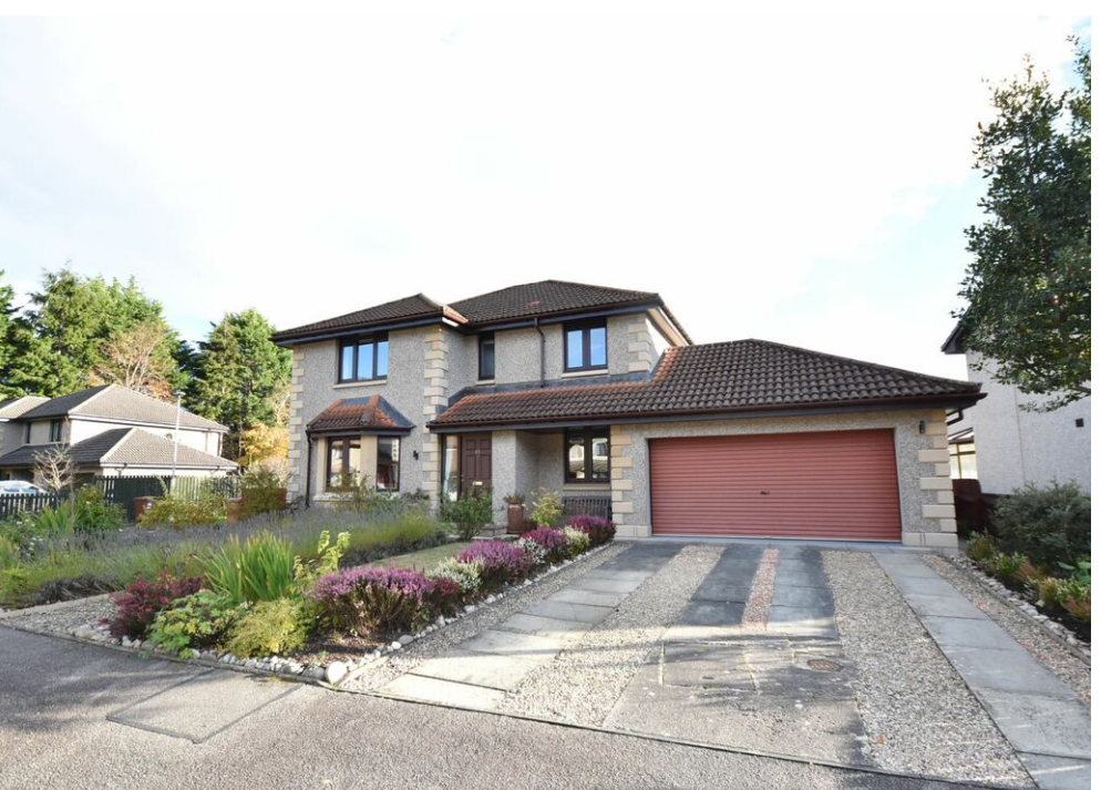
Offers Over £315,000

4/5 Bedroom Detached House situated on a Corner Plot with walking distance of Milnes Primary and Secondary Schools