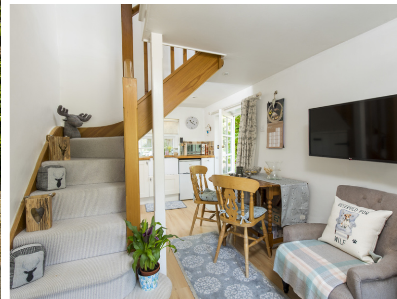
The Nest, Speen Road, North Dean, High Wycombe, Buckinghamshire, HP14 4NL