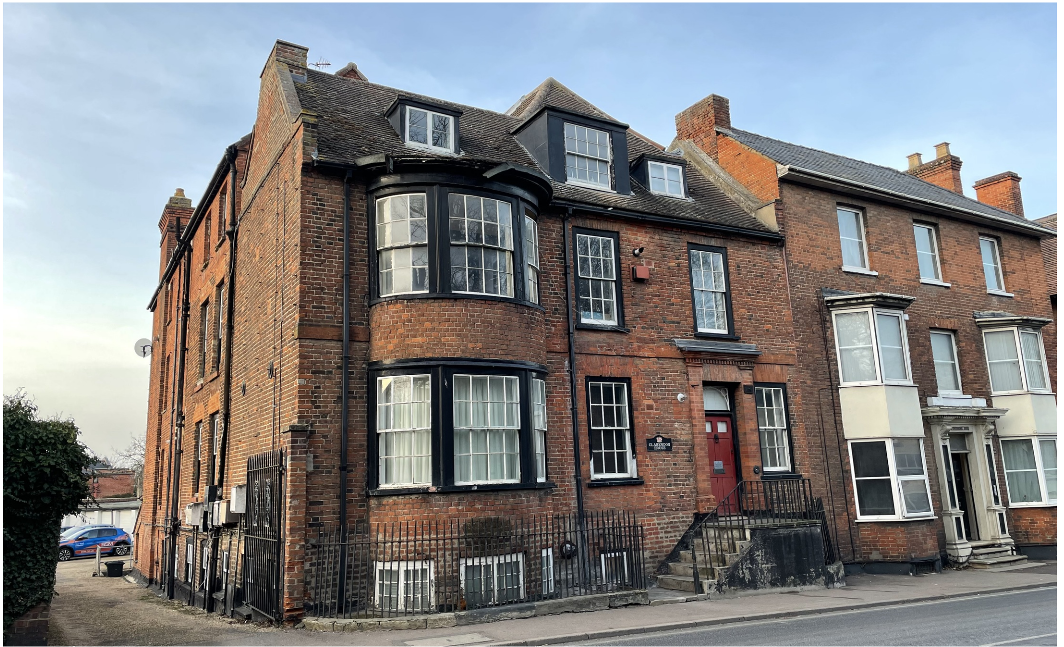
Clarendon House, High Street, Newmarket