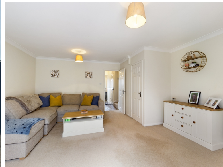
1 Greenacres, Green Hill, High Wycombe, Buckinghamshire, HP13 5QB