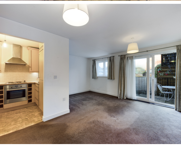
Flat 1 The Cedars, Roberts Ride, Hazlemere, High Wycombe, HP15 7DP