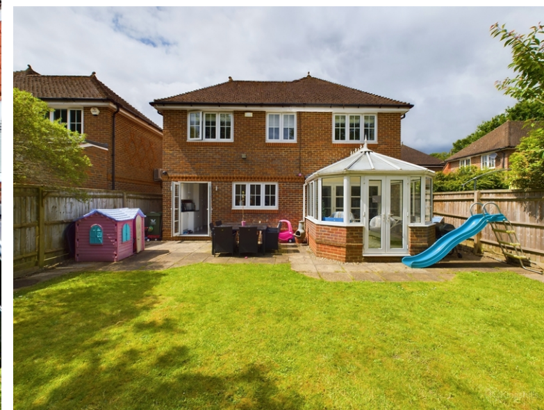
4 Nash Place, Penn, High Wycombe, Buckinghamshire, HP10 8ES