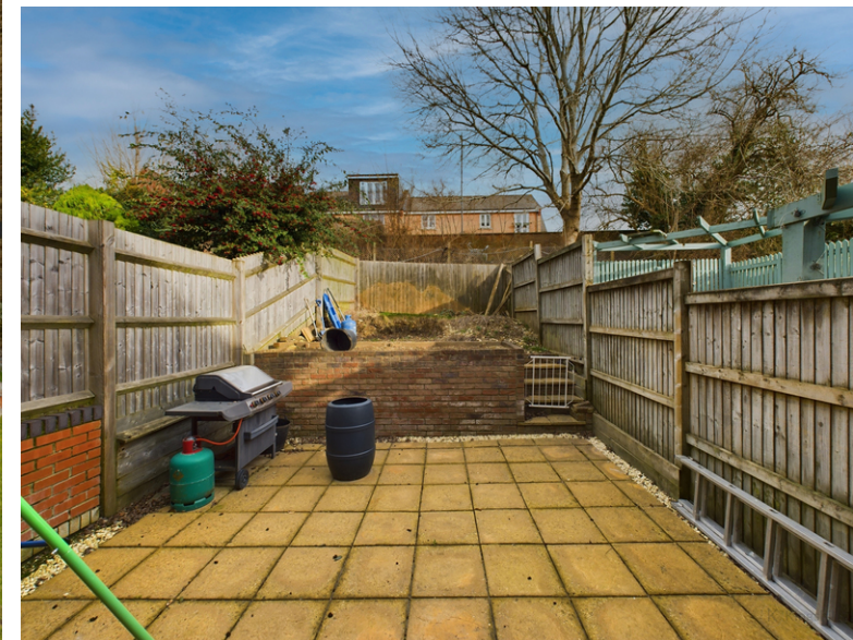
88 Garratts Way, High Wycombe, Buckinghamshire, HP13 5XZ