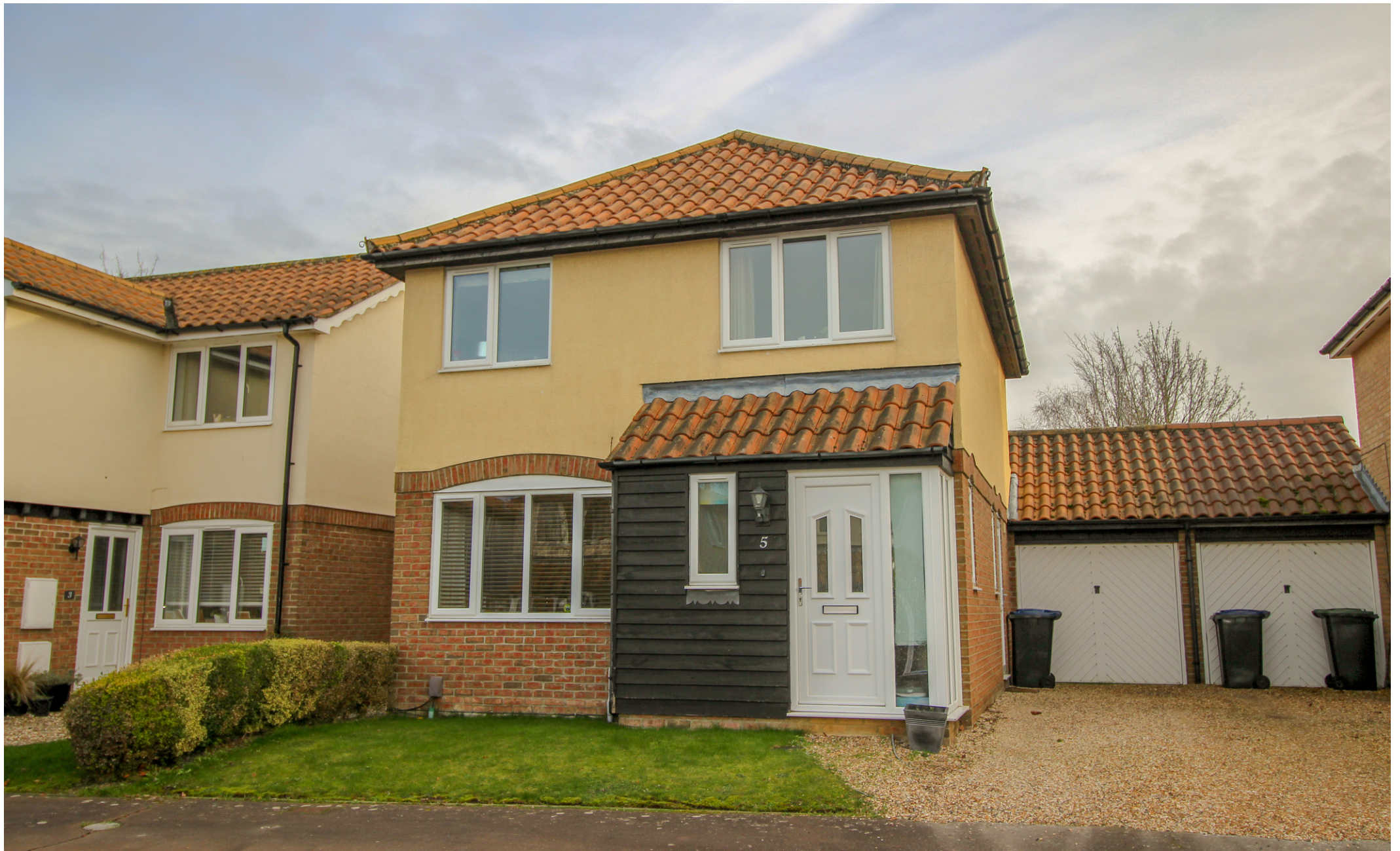
Bayfield Drive Burwell Cambridgeshire