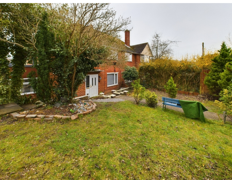
28 Buckingham Drive, High Wycombe, Buckinghamshire HP13 7XT