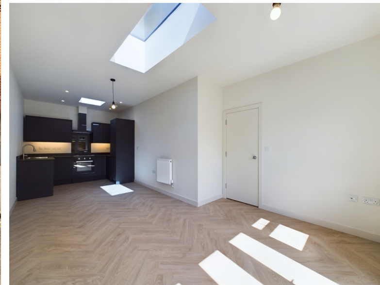
Flat 4 148 London Road, High Wycombe, Buckinghamshire, HP11 1DQ