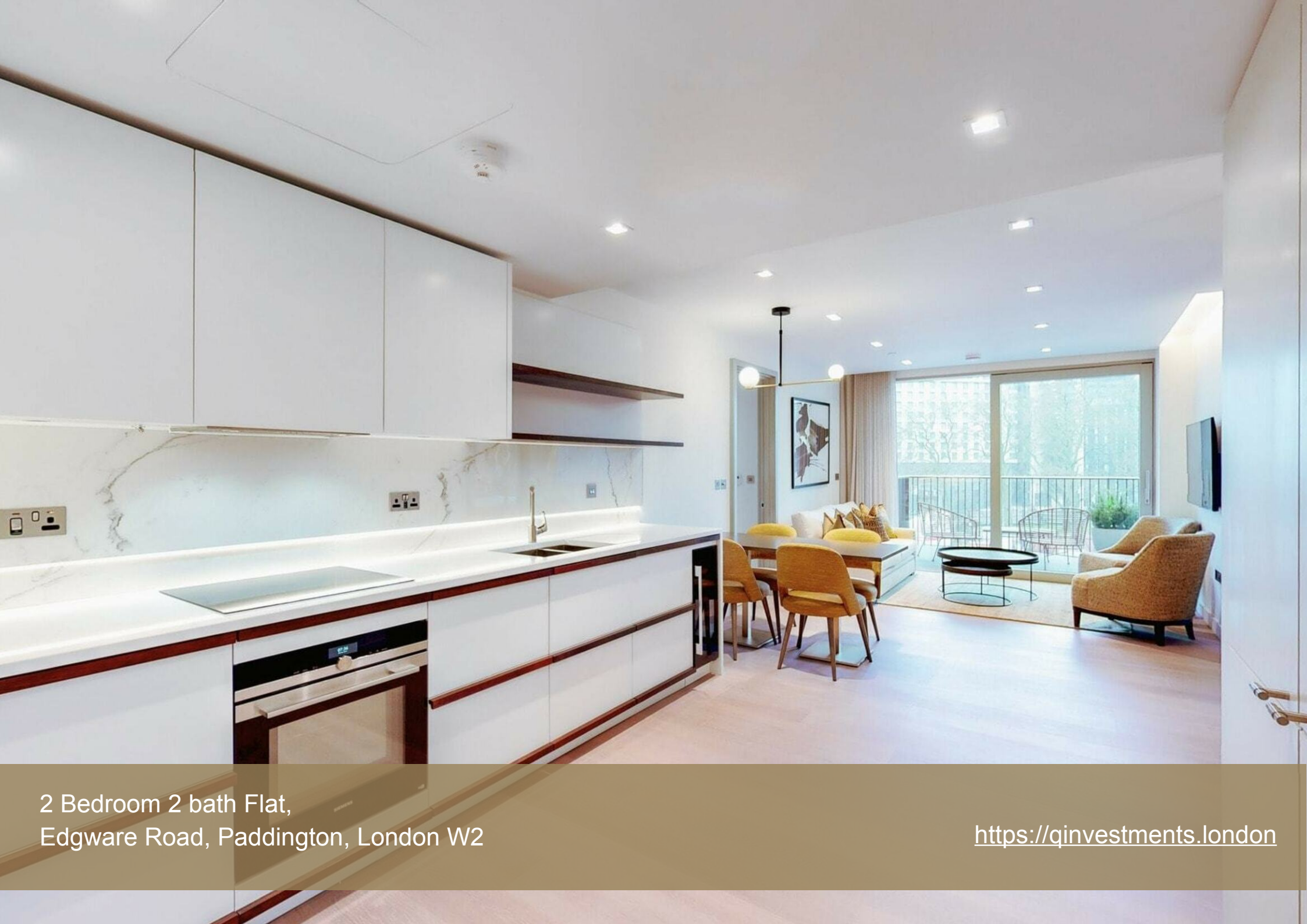
2 Bedroom 2 bath Flat, Edgware Road, Paddington, London W2