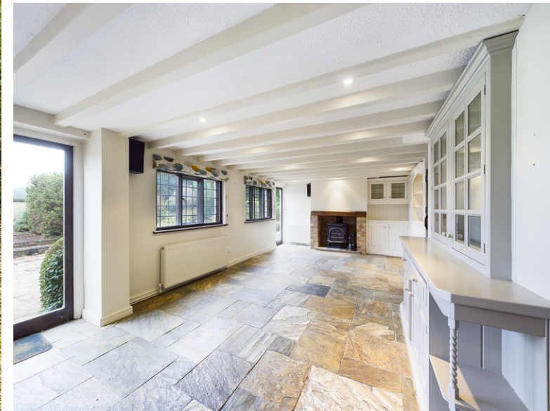
The Barn House 46 Lower Icknield Way, Chinnor, Oxford, OX39 4EB