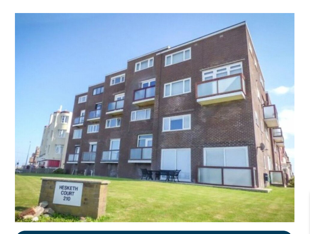
Flat 4, Hesketh Court, Queens Promenade, Bispham, Blackpool, FY2 9JJ