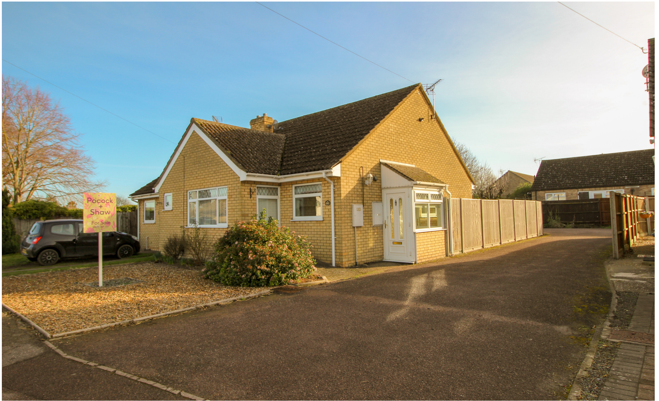
Ness Road, Burwell