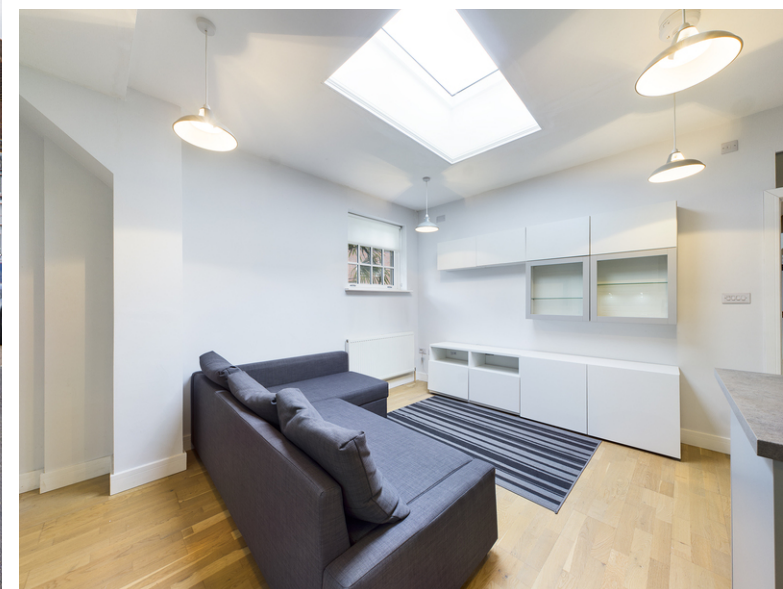
Flat 2 24 High Street, High Wycombe, HP11 2AG