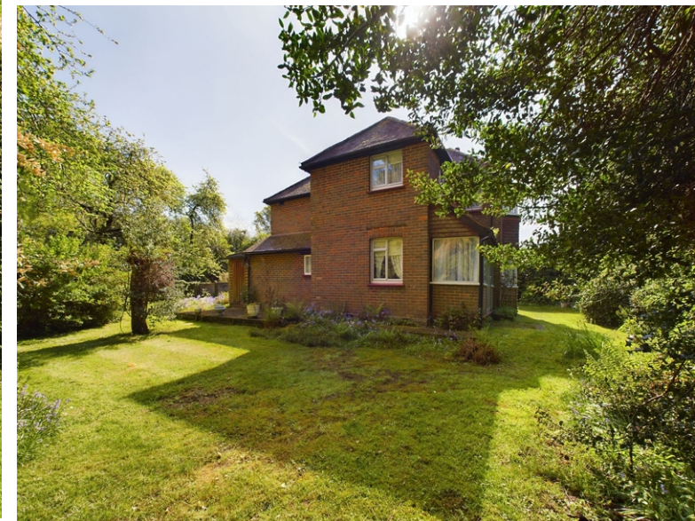
Gorse Glade, Penn Common, Penn, Buckinghamshire, HP10 8LL