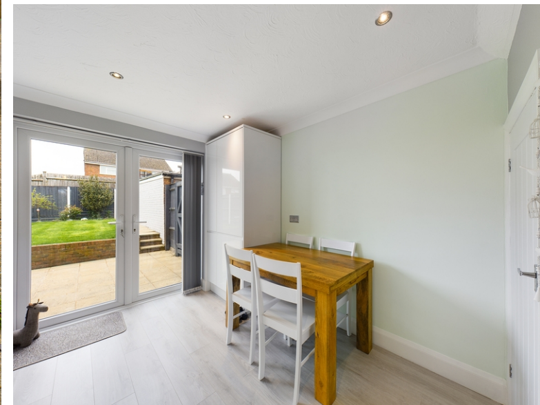
4 Tamar Close, High Wycombe, Buckinghamshire, HP13 7BG