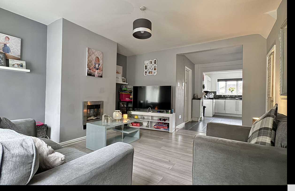
Our View " A well presented family home with a large attractive garden and two lock up storage units"