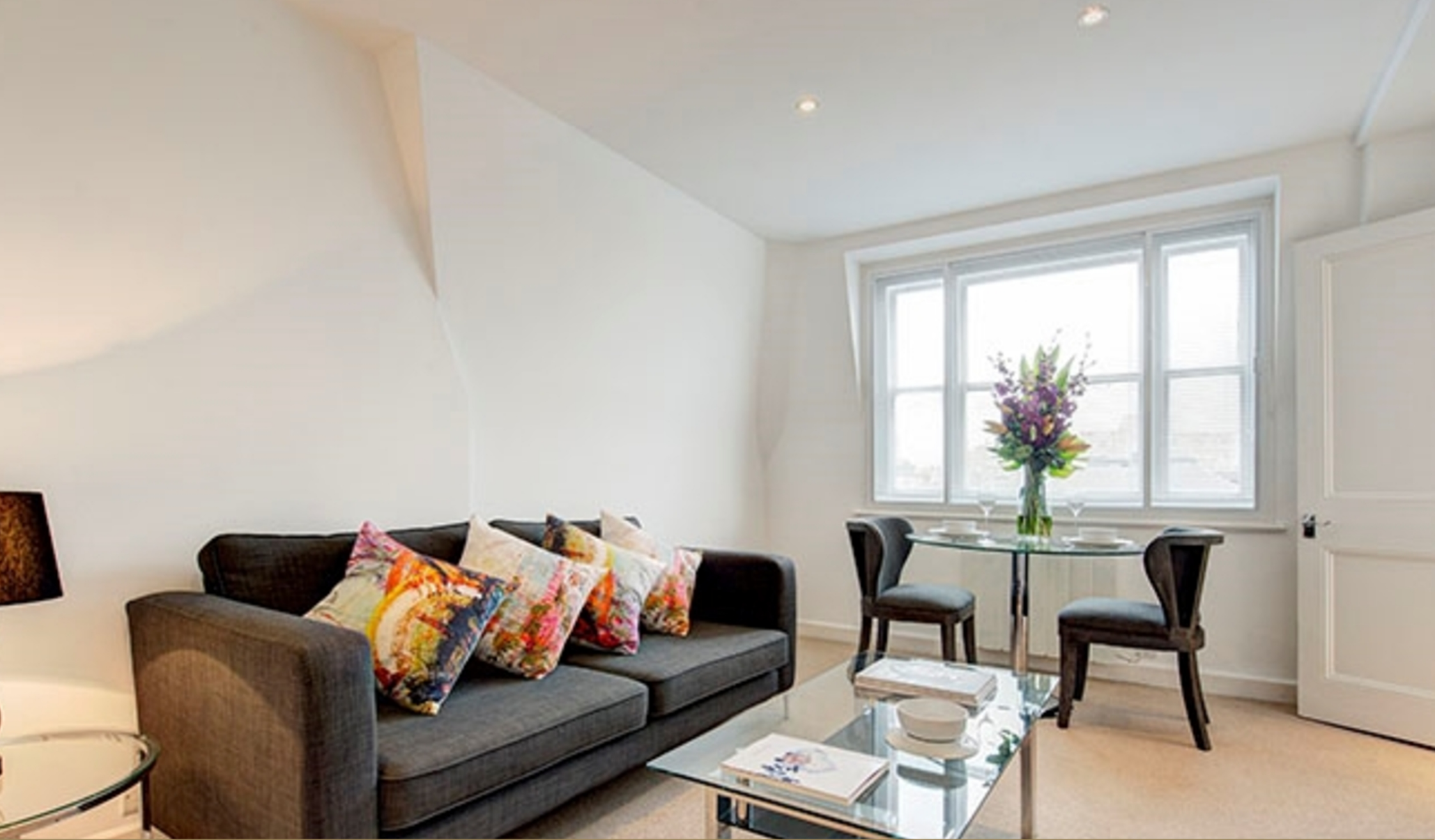
Studio Bedroom 1 bath Apartment / Flat, Hill Street, Mayfair, London W1