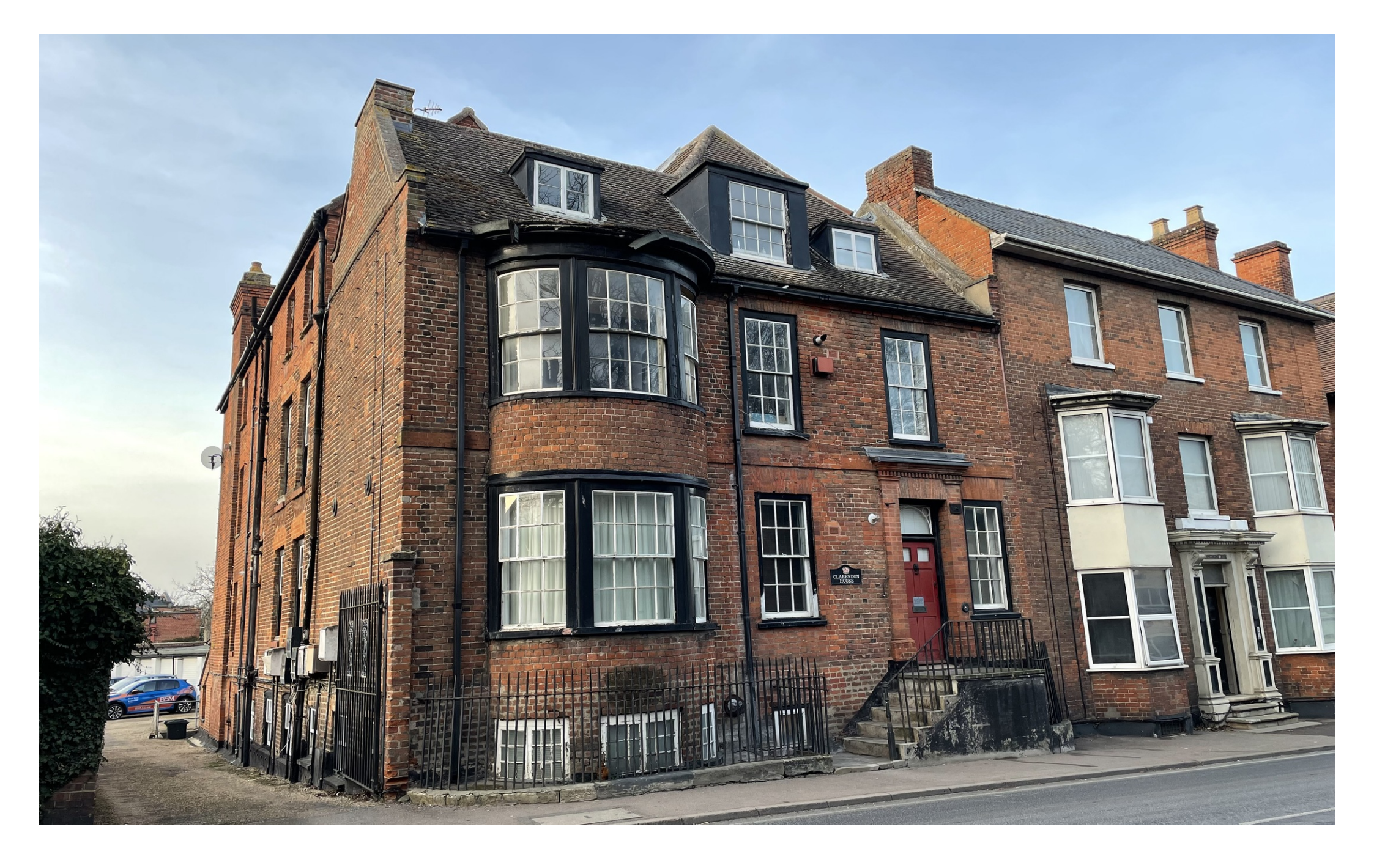
Clarendon House, High Street, Newmarket, Suffolk