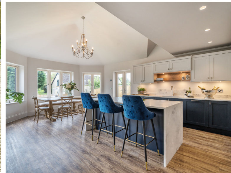
1 Appleyard Close, Whitchurch, Aylesbury, Buckinghamshire, HP22 4FX