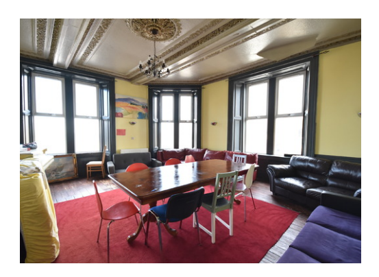
Fixed Price £249,950

Located in the heart of Buckie is this former Hotel which has been converted into an HMO providing 12 letting rooms spread across 2 floors providing a rental investment.