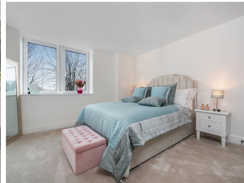
Flat 55, The Residence, Wycombe Road, Saunderton, High Wycombe, HP14 4EA