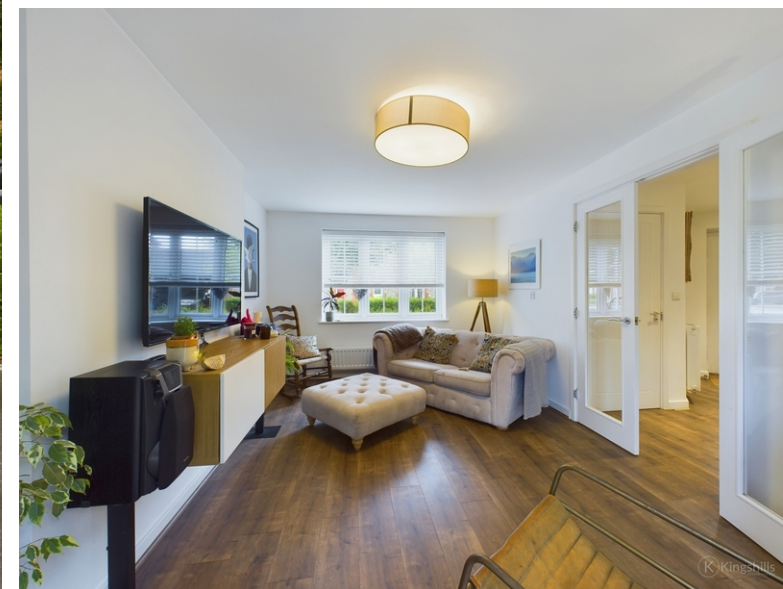
44 Wayfarers End, Longwick, Princes Risborough, Buckinghamshire, HP27 9FT