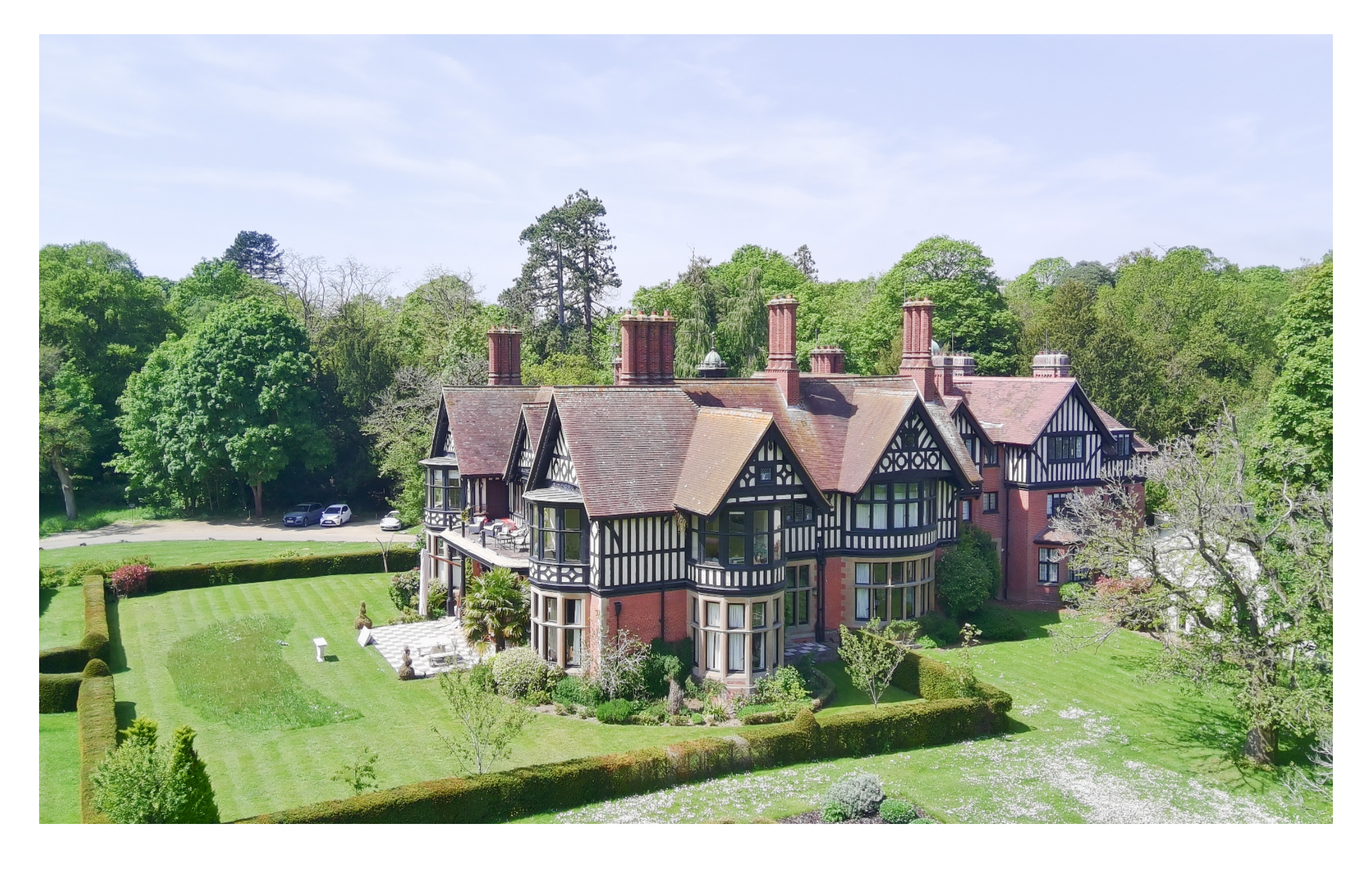
The Manor, Herringswell